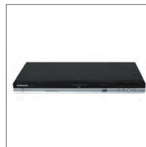
DVD Player EUR 40.00 Cod 025 010 130 030