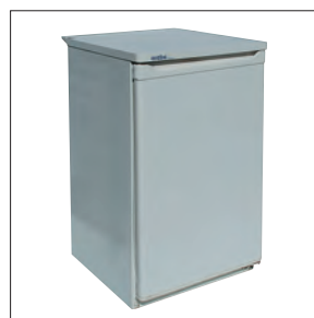
Frigider ARCTIC (180 l) EUR 44.00 Cod 025 010 070 020