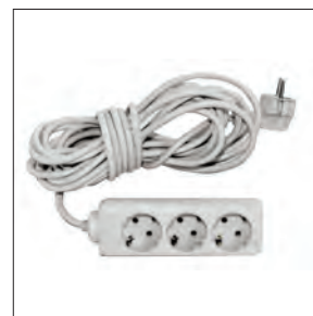
Prelungitor 230V, 10A, 5m EUR 10.00 Cod 019.010.279.000